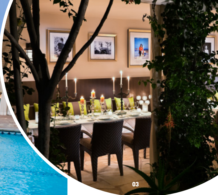
04 Cavatina Restaurant – Outdoor Patio