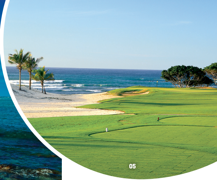
01 Las Manzanillas beach